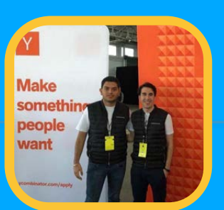
They participated in Combinator with their Startup Nowports